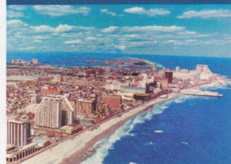
The spectacular Atlantic Ocean Shore.

Departure: Fairfield Commons Mall, 4869 Nine Mile Rd, Richmond, VA @ 8 am