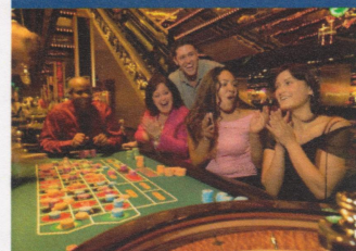
World-class gaming in Atlantic City awaits!