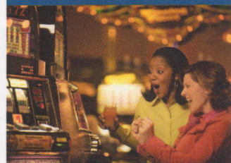
Give Lady Luck a Spin!